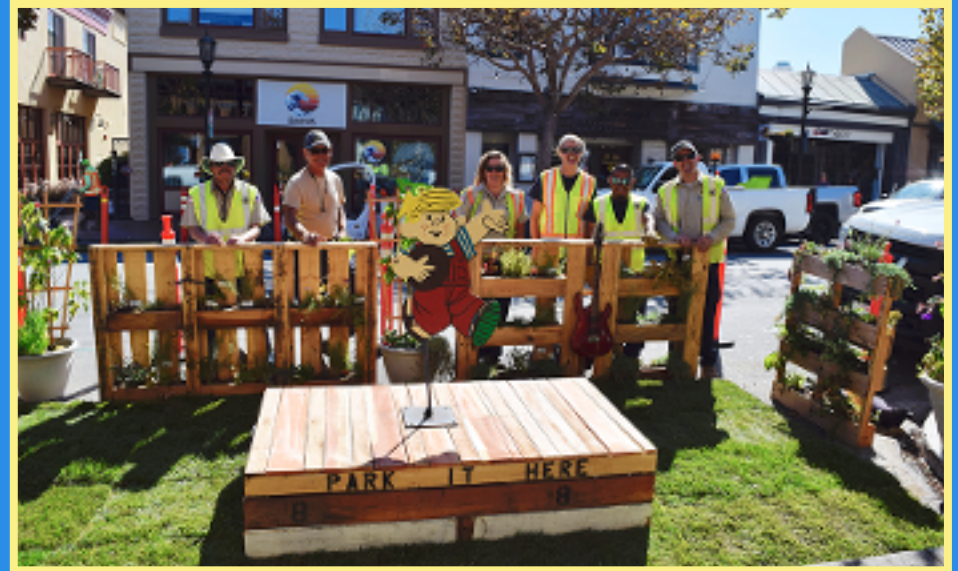
PARKing Day 2019

In 2017, Monterey joined with more than 180 cities throughout California in the Healthy Eating Active Living (HEAL) Cities Campaign. The HEAL Cities Campaign aims to reduce and prevent obesity by engaging municipal leaders to champion healthy eating and active living in their communities through adoption of policy and promotion of opportunities for residents and municipal employees. The campaign provides coaching and technical assistance to support this process.