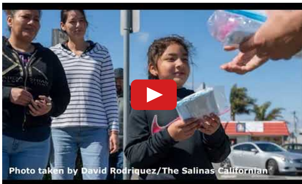
The Families and Friends of Stevenson School Anti-COVID-19 Team