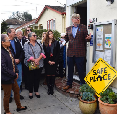
Community Human Services (CHS) Safe Place Reopening

The Housing Programs Office has an approximately $1 million annual budget through a combination of funding sources, including Federal Community Development Block Grants (CDBG), Program Income (lease agreements, loan repayments, etc.), Successor Housing Agency Funds, and the HOME Program.