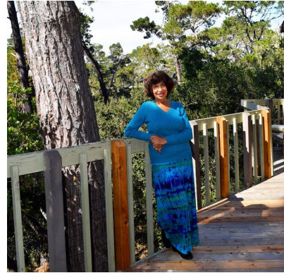
Rehabilitation Loan & Grant Program