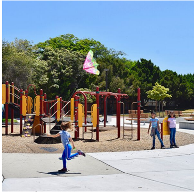
Montecito Park Improvements Phase 2