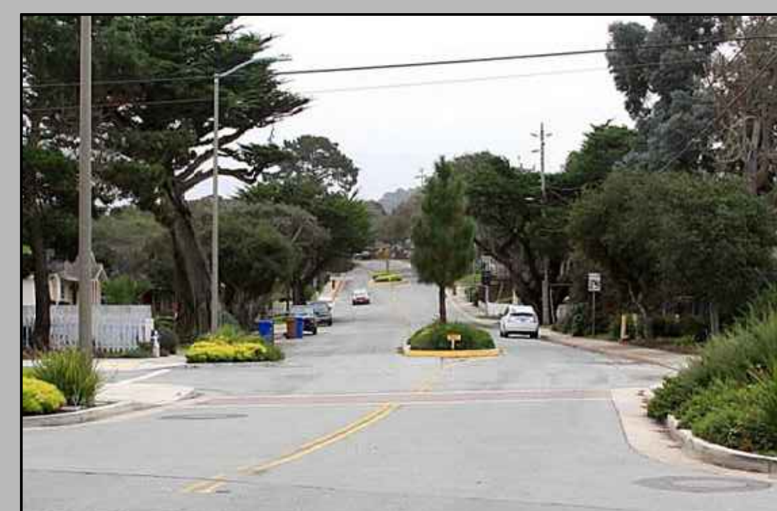
Raised islands in the center of the roadways