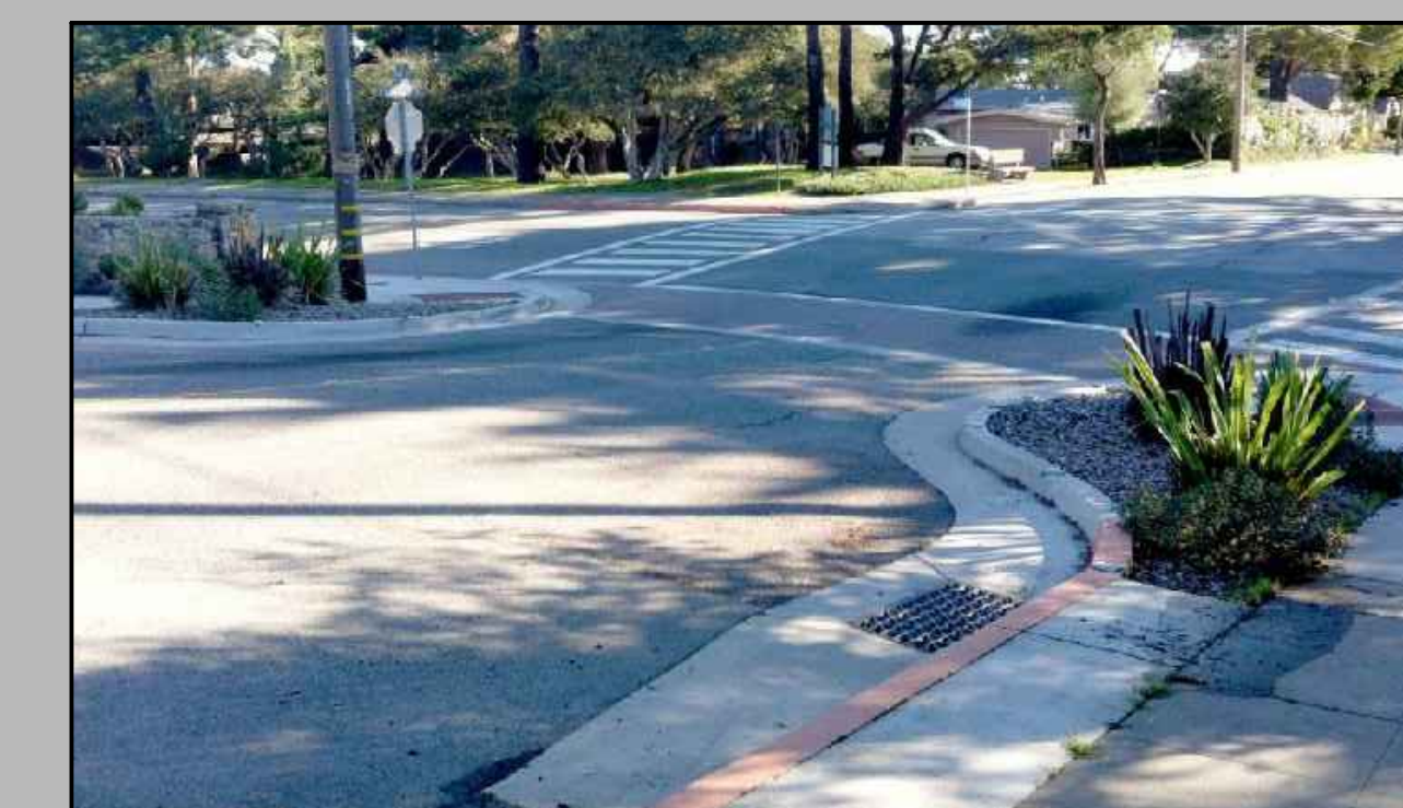
Narrow roadways at intersections to shorten pedestrian crossings