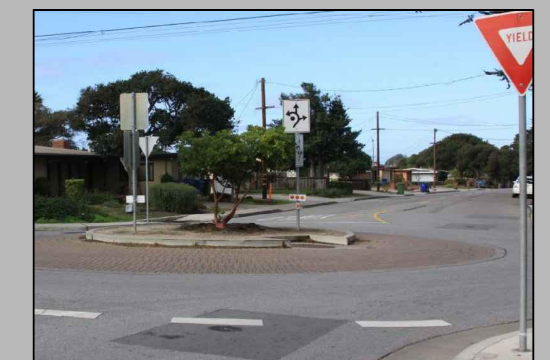
Traffic circles with raised circular medians