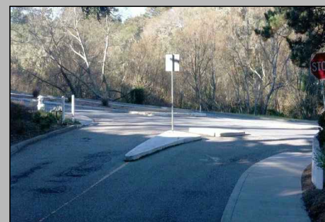
Barrier islands that prevent certain turning movements