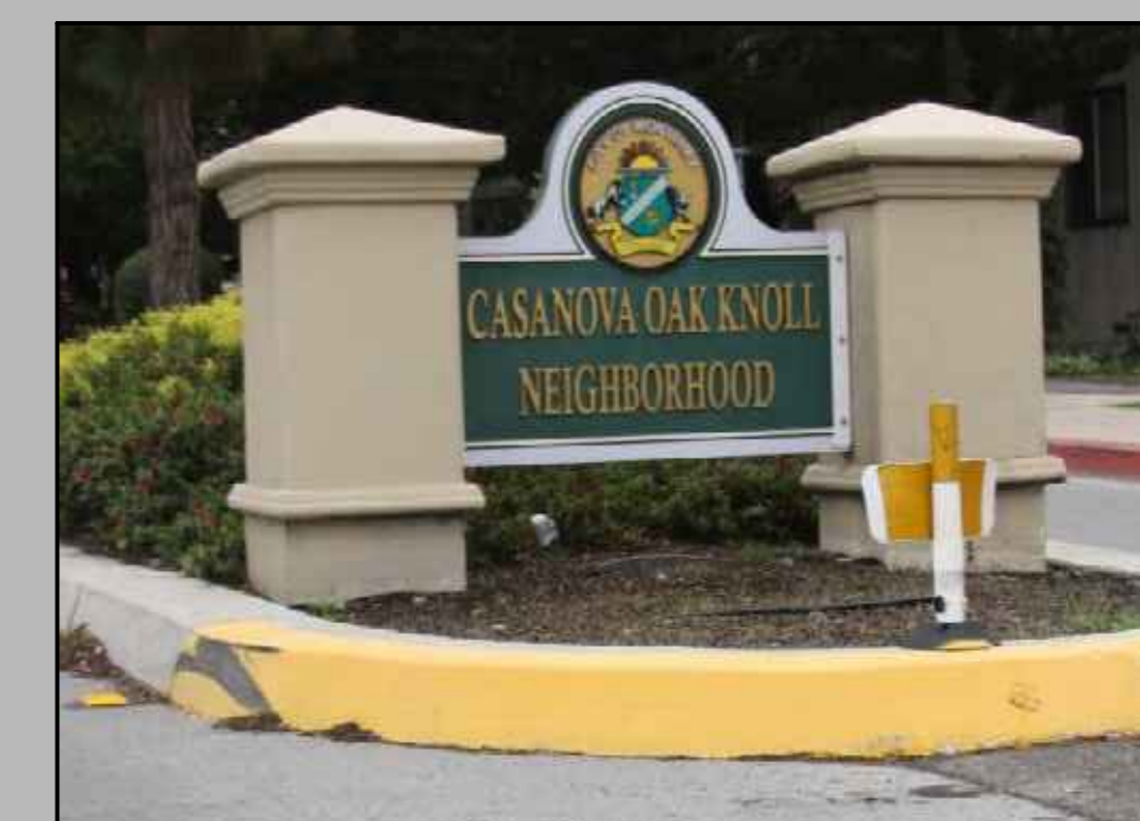
Signs in medians that identify neighborhood entrances