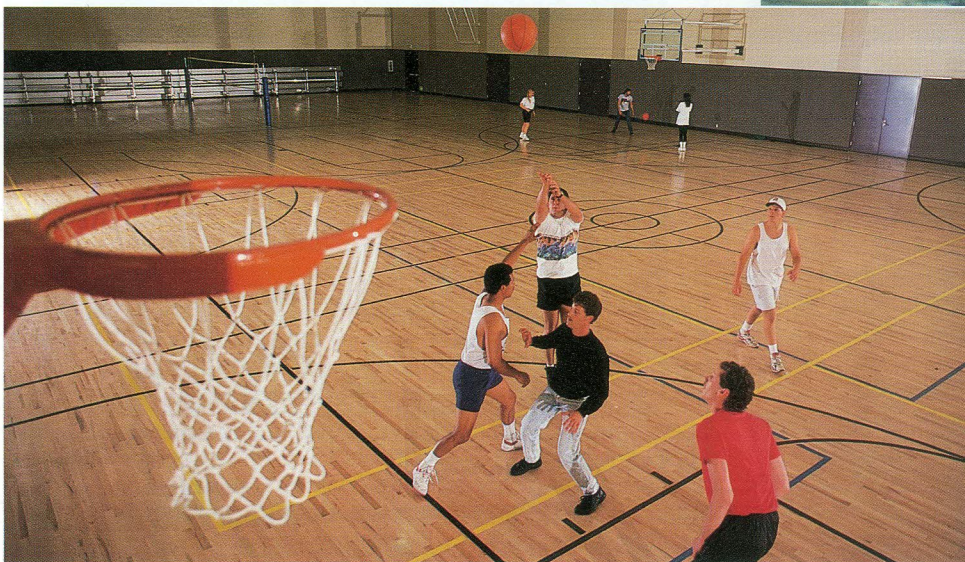
The gymnasium offers three cross-courts for basketball and a variety of other simultaneous sports activities.