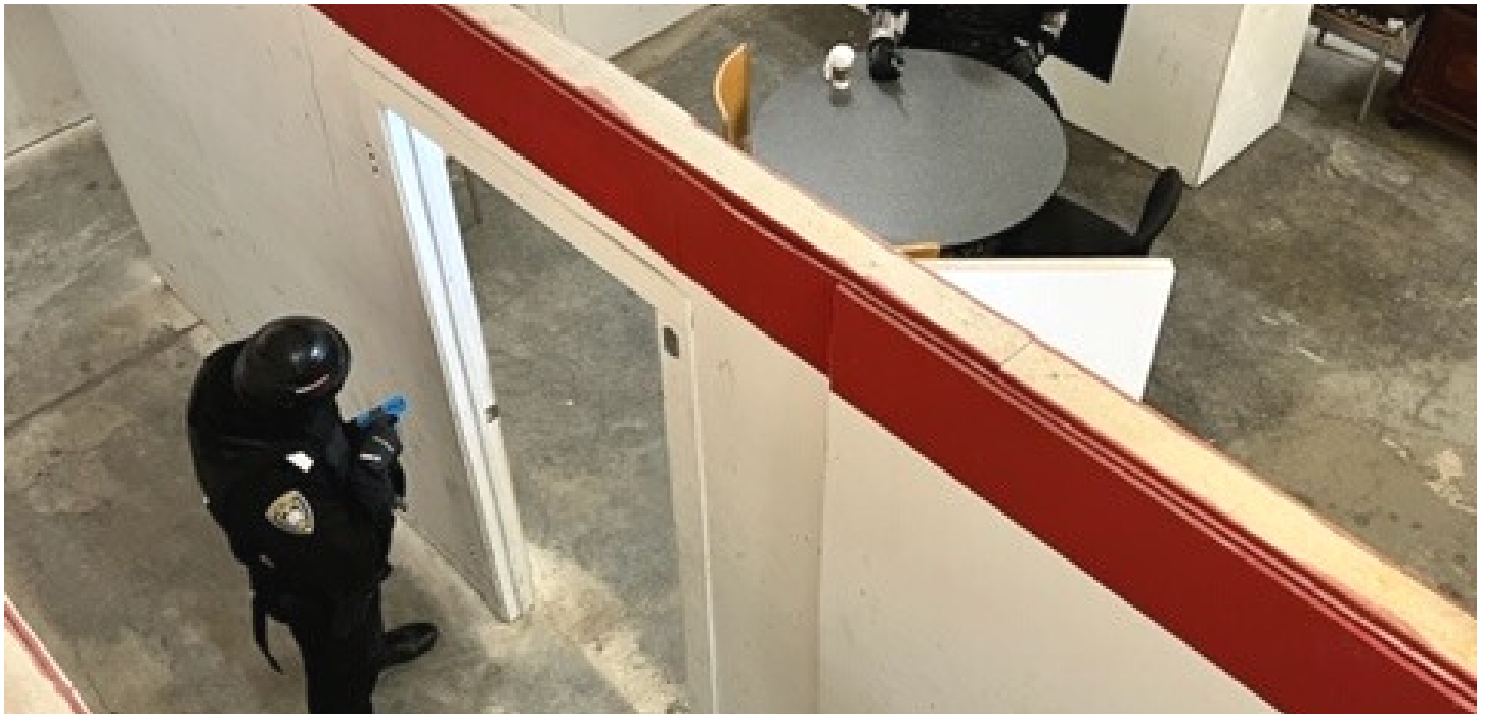
Officers participated in Integrated Communications, Assessment and Tactics (ICAT) Training.