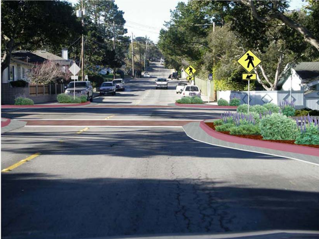
Figure 3: Rendering of Curb Extensions with Pedestrian Crossing Treatment on Prescott Avenue at Belden